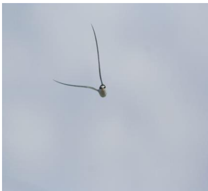
Aggressive Little Tern

The Little Terns became much more aggressive when their chicks had hatched and were less tolerant. It became necessary to keep a greater distance from the enclosure. Because of changes in the type of fencing used on the eastern side of the enclosure, repairs could be carried out relatively quickly, thereby causing much less disturbance to the birds than last year. The Little Tern adults were more aggressive than seen before and they bombed the wardens on a number of occasions even though they were well outside the enclosure, they also swooped down on people even though they might be a good distance from the enclosure. It became necessary to warn wardens to wear head protection and hats were worn when going in to check nests.