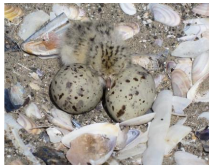
Little Tern chick and 2 eggs