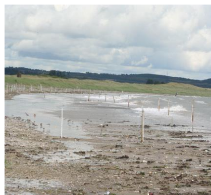
Spring Tides entering the enclosure