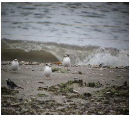
2 juvenile Little Terns with adult