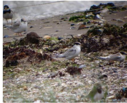
Juvenile Little Terns