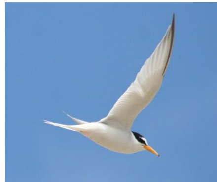
Aggressive Little Tern