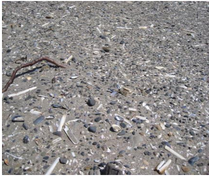
3 chicks – very difficult to see