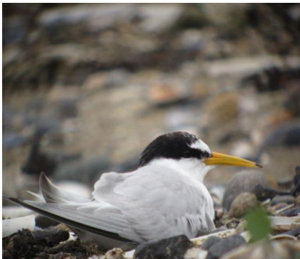
Adult Little Tern

One nest was moved as it was very close to the high water mark during the spring tides, this was successful and the eggs hatched.